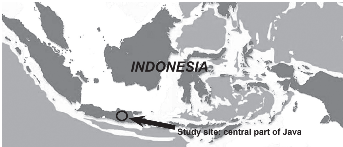
Figure 1. Location of study

available. Figure 1 shows the location of the study site.